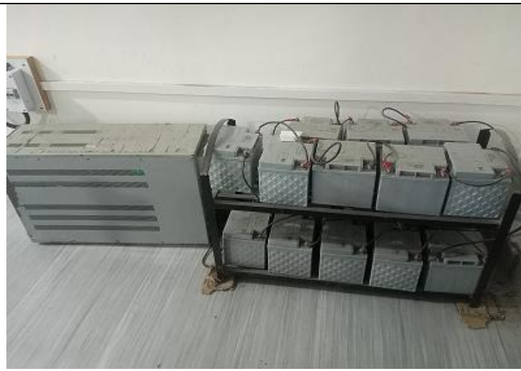
UPS-7.5 KVA MODEL NO OL7500 (Assembled)